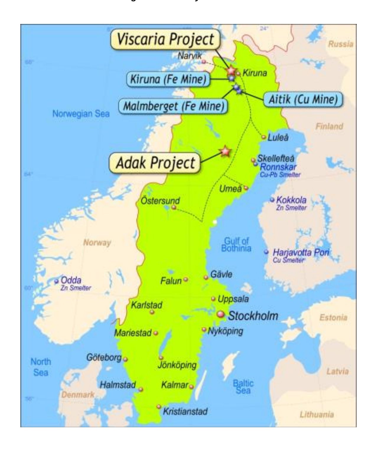
Figure One - Project Location