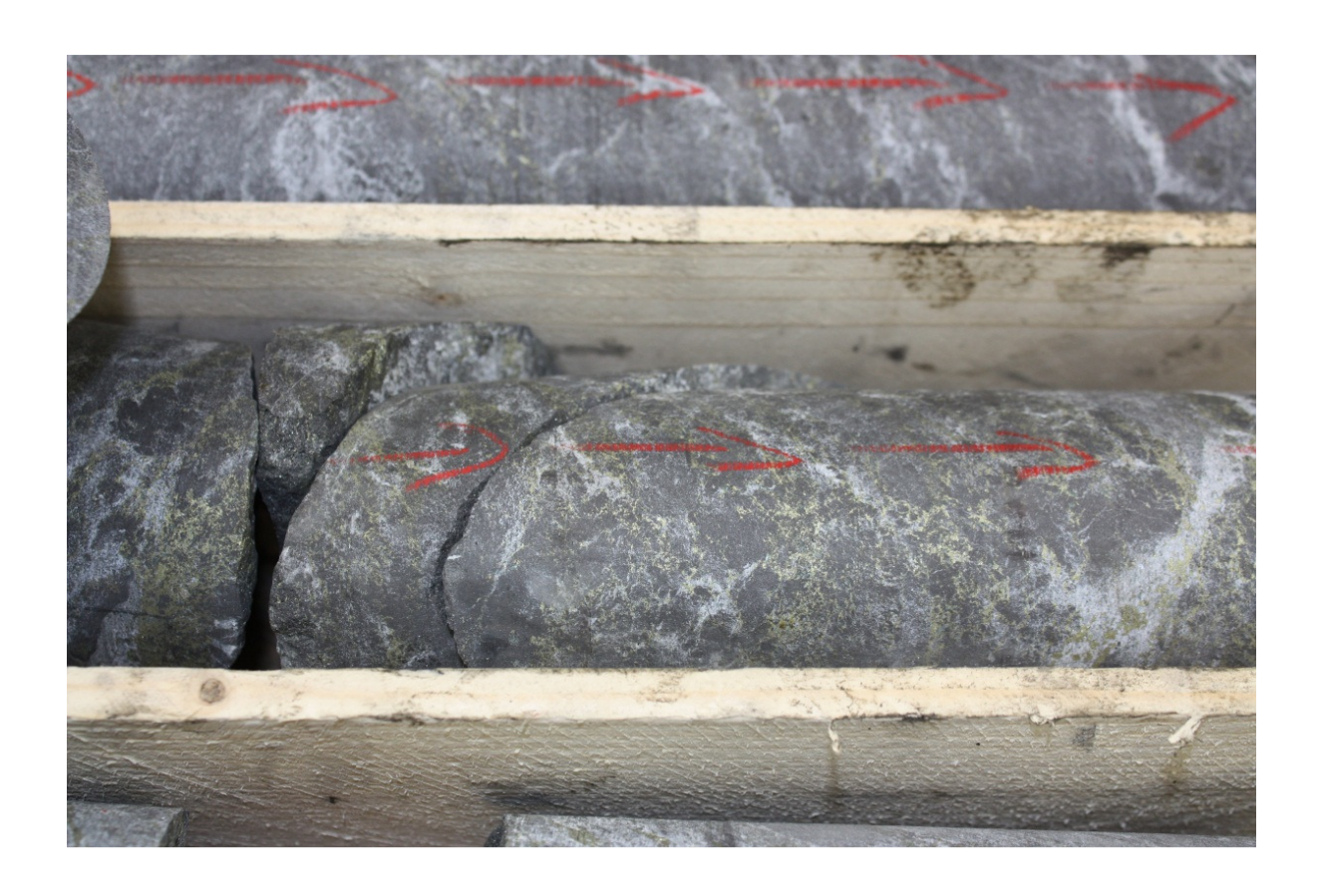
Figure Three - Typical Copper-Magnetite Mineralisation Intersected in Drill Hole VDD0128