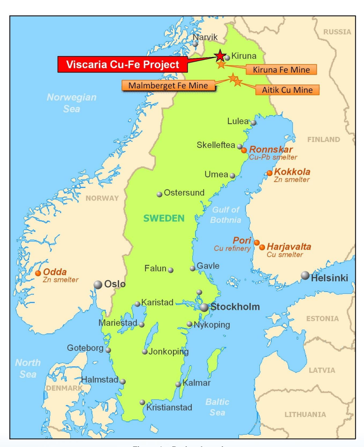
Figure 1 - Project Location