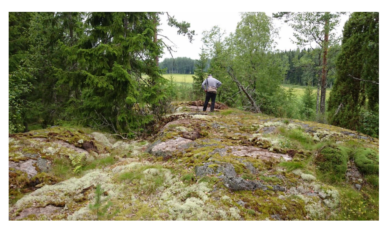
Figure 2: Photograph showing the Kietyönmäki main pegmatite dyke (looking NW), the forest cover and, in the background, areas of farmland. The main dyke is approximately 20m wide and has parallel narrower dykes which are also lithium bearing. The drilling program will test all dykes in the vicinity of the main deposit.

Data compilation is in progress over the nearby Riukka and Satulinmäki gold prospects. The areas of gold mineralisation have been visited in the field, and data prepared to deliver an initial exploration model for further testing. Historical drilling results are currently being reviewed in 3D. This review is expected to be completed soon and will be reported separately.