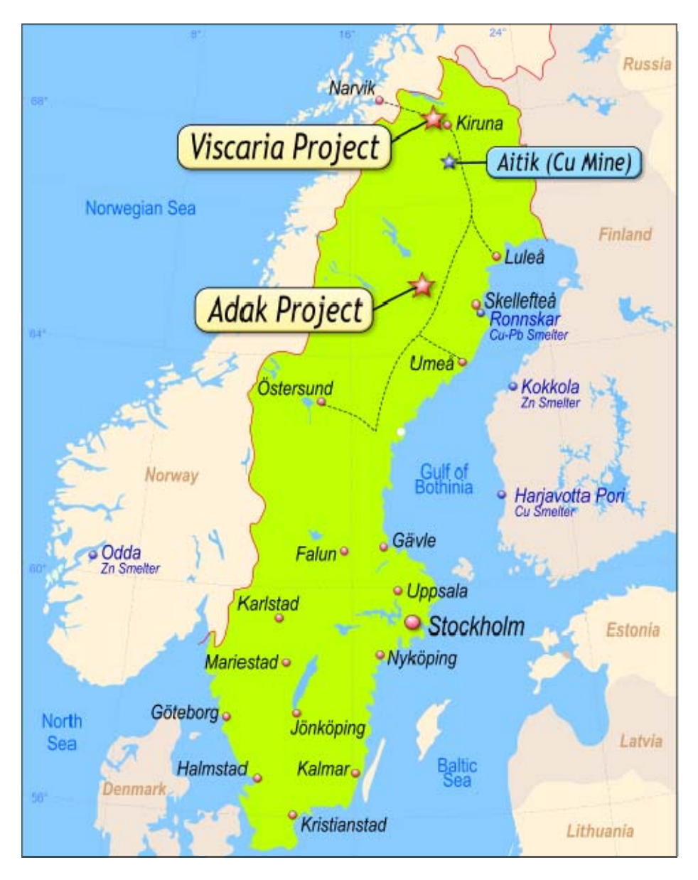
Figure 2 - Project Location Map