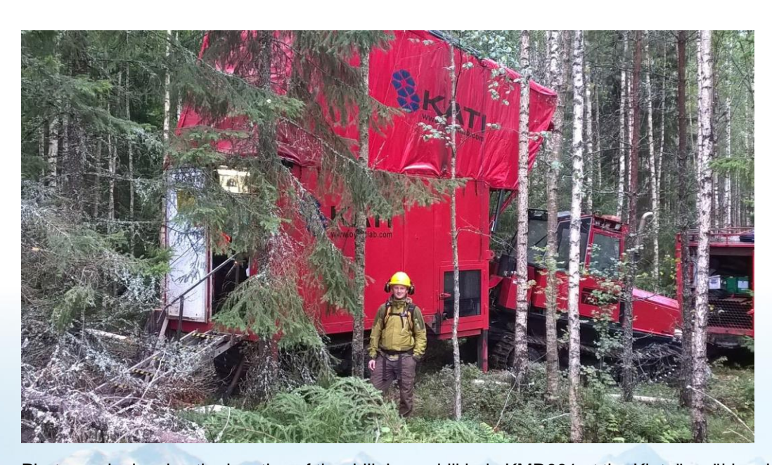
Photograph showing the location of the drill rig on drill hole KMD001 at the Kietyönmäki main pegmatite dyke.