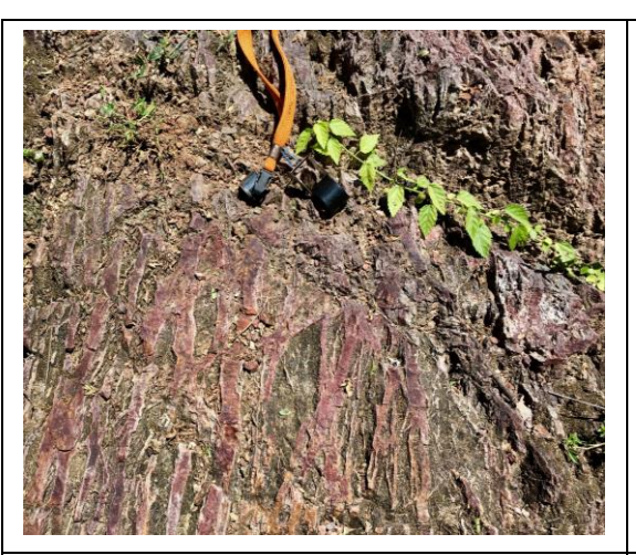
Sheeted veins at Bramaderos Limon Prospect