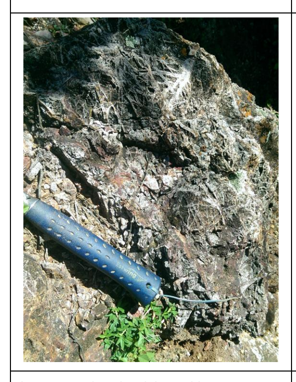
Intense stockwork veining at Limon prospect