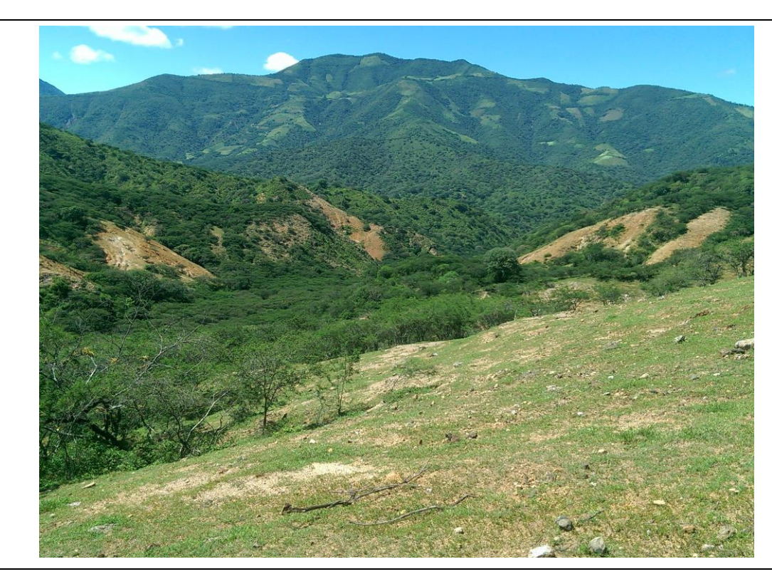
Limon prospect in foreground showing argillic alteration on slopes surrounding area of outcropping porphyry-style mineralisation