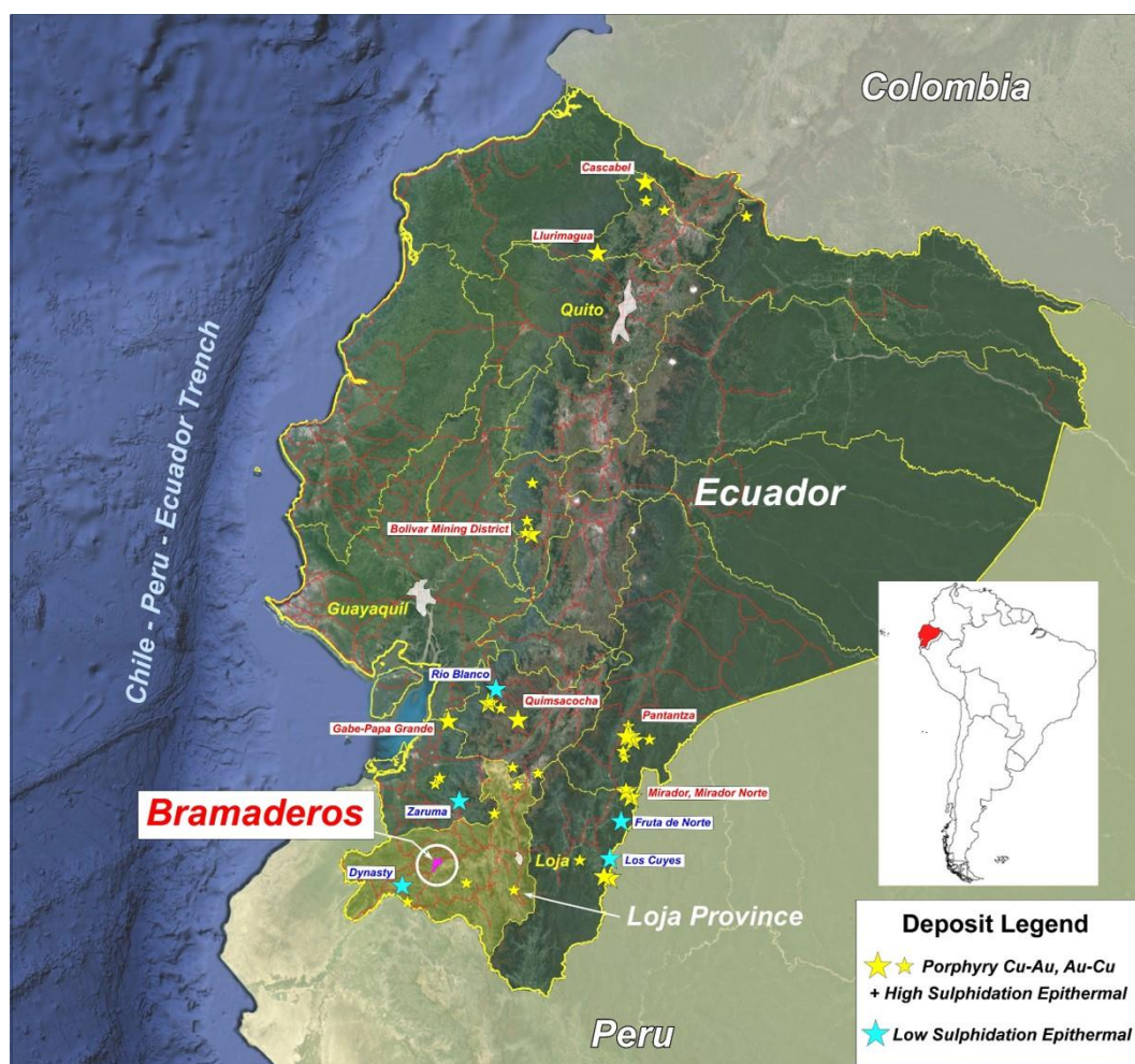
Figure 1: Distribution of mineral deposits in Ecuador and the location of the Bramaderos property in southern Ecuador.

A location map of the Bramaderos concession is shown below. The joint release from Cornerstone can be seen in PDF format by accessing the version of this release on the Company's website ( www.cornerstoneresources.com ).