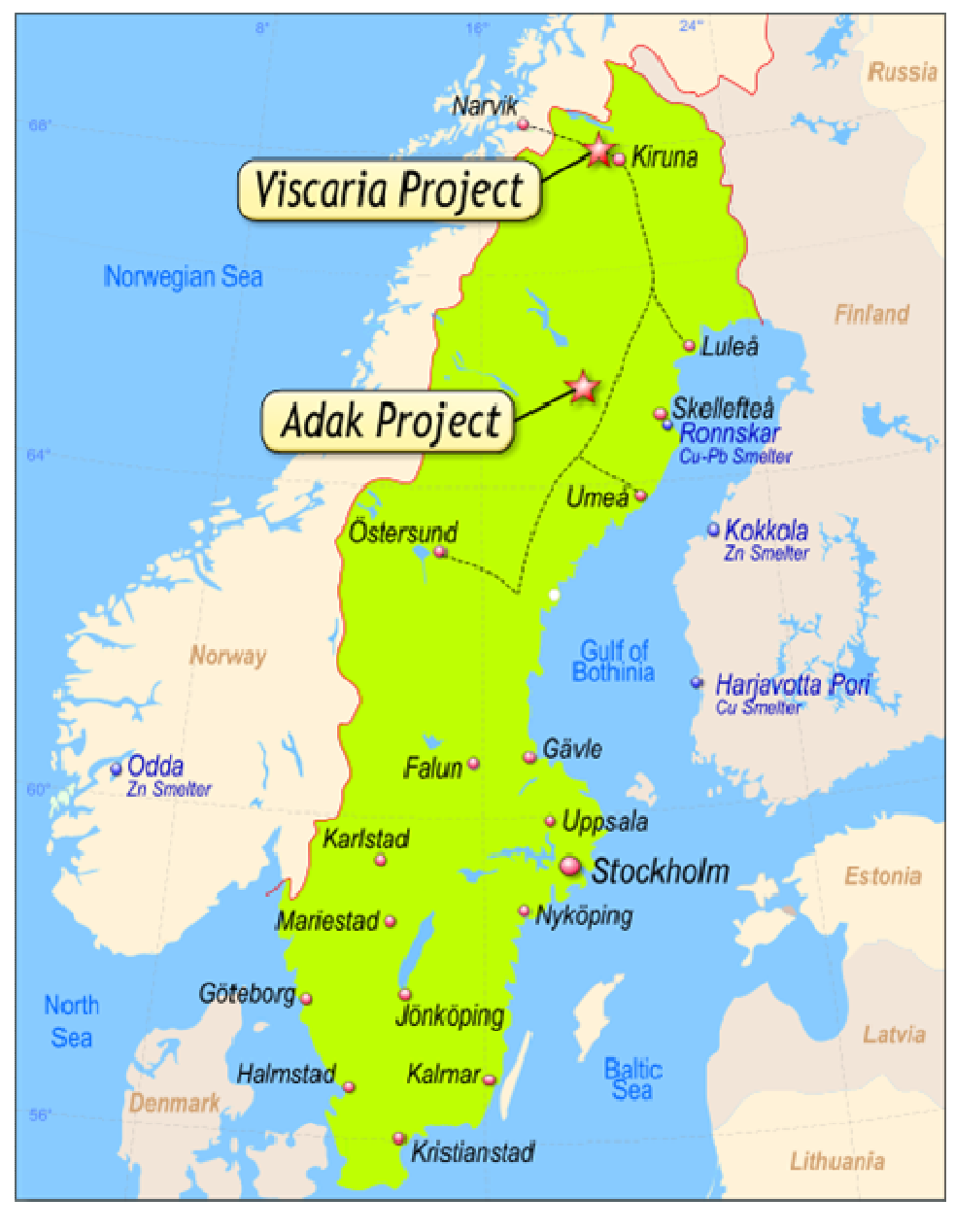
Project Location Map